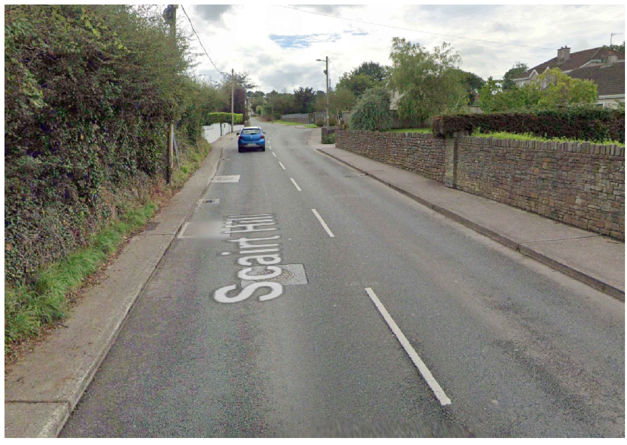
Sightlines - Image A - South