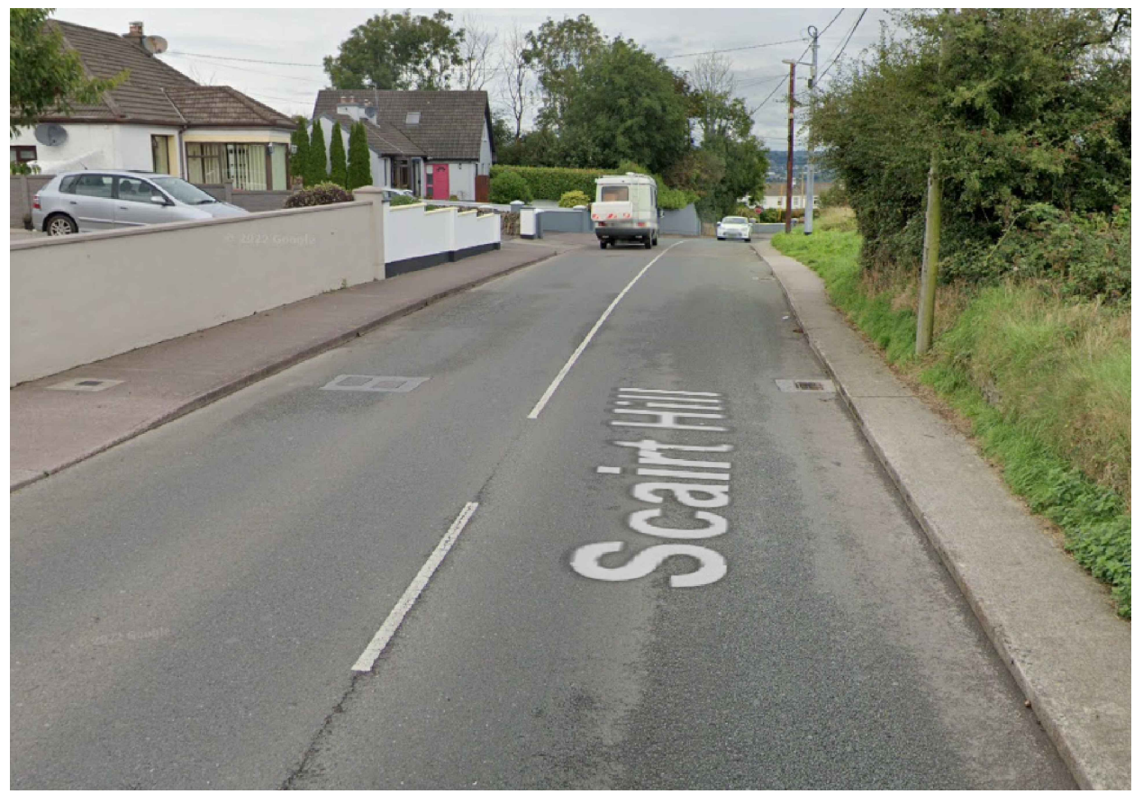
Sightlines - Image B - North

Sight distance of 49m as per Table 4.2 of Design Manual for Urban Roads & Streets (DMURS)