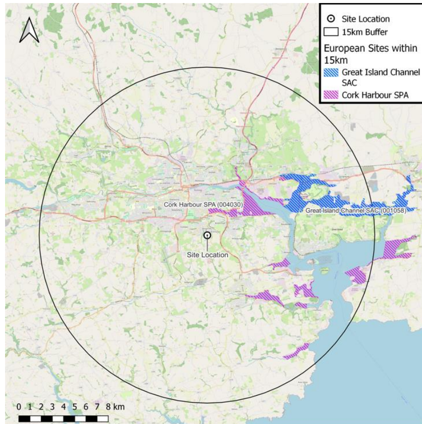
Figure 5 Location of Natura 2000 sites relative to Site at Scairt Cross, Douglas, Cork

All other Natura 2000 sites excluded based on the nature of the existing and proposed development, distance from the subject site, lack of surface water features within and in the vicinity of the proposed development site and no ecological connectivity to the Site.