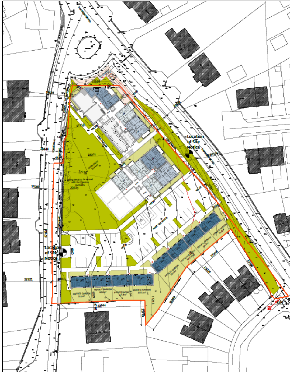
Figure 2 Proposed Site Plan