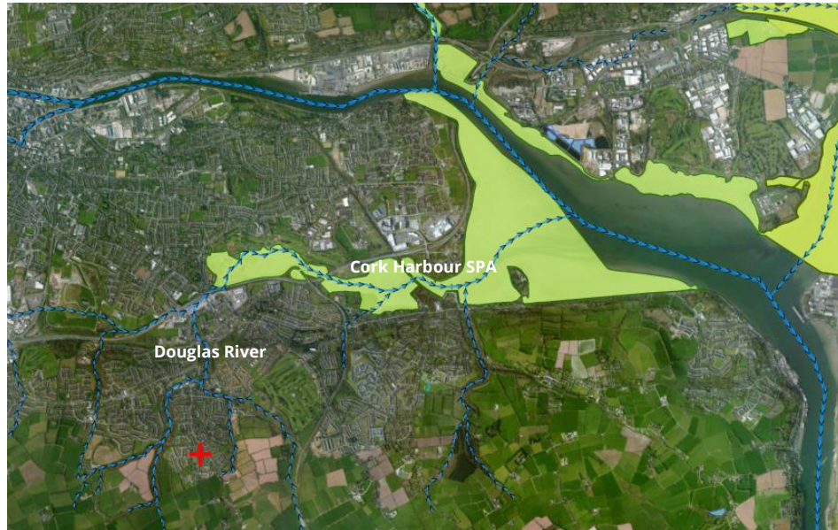
Figure 6 Site location and WFD status of watercourses in proximity