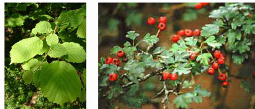
Corylus avellana Crataegus monogyna