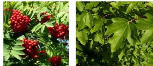
Sorbus aucuparia Acer campestre