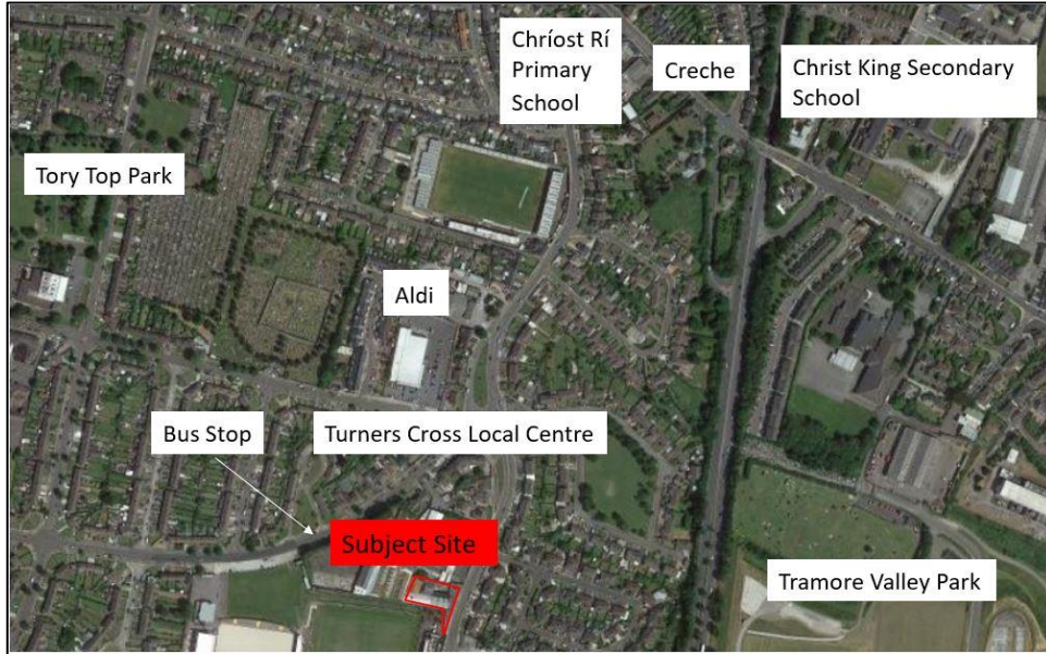
Figure 2 Site location

recreational uses (Fig 2).. The site is located close to a significant employment area of the South Environs, which includes Tramore Road/Pouladuff Road/Kinsale Road and Forge Hill. The area is well served by three public amenity areas with Tory Top Park located c. 600m from the site, with Tramore Valley Park some 700m away, and Cork Lough located c. 1km from the proposed development.