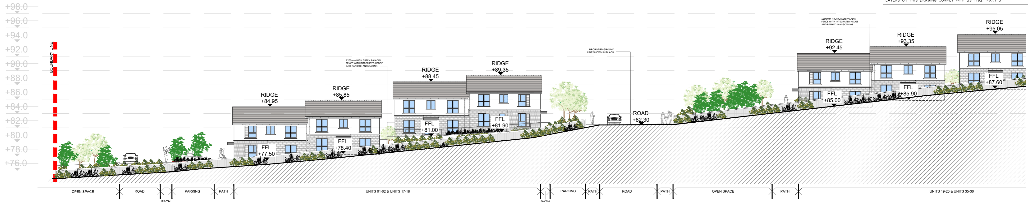
SECTION C-C (PART A) SCALE 1:250

DO NOT SCALE. WORK TO FIGURED DIMENSIONS ONLY. ALL EXISTING DIMENSIONS TO BE CHECKED ON SITE. DRAWN ON AUTOCAD R2004 AT DEADY GAHAN ARCHITECTS LTD LAYERS ON THIS DRAWING COMPLY WITH BS 1192: PART 5