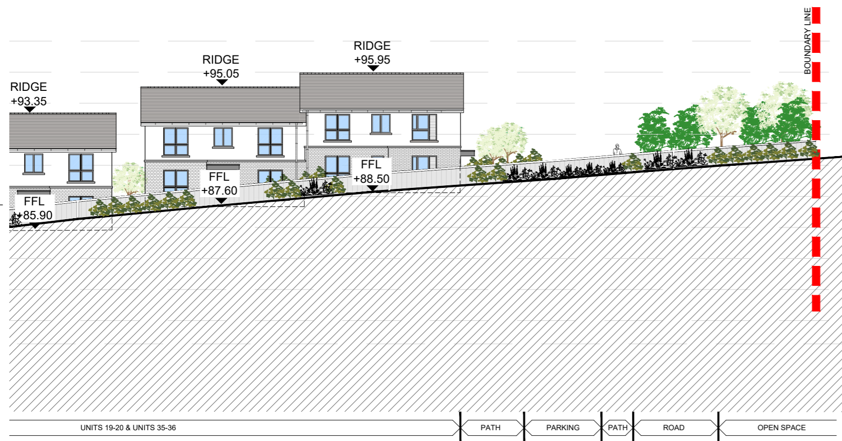
SECTION C-C (PART B) SCALE 1:250