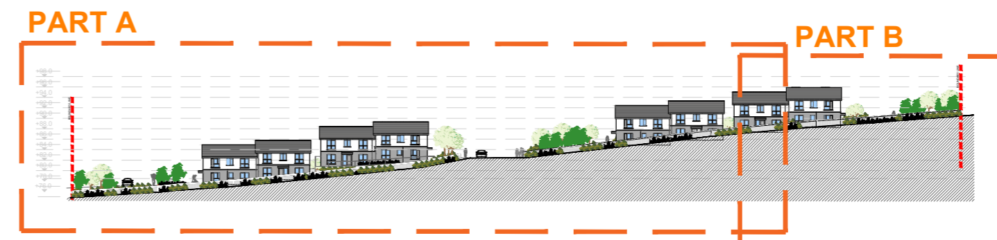
SECTION C-C KEY SCALE 1:1000