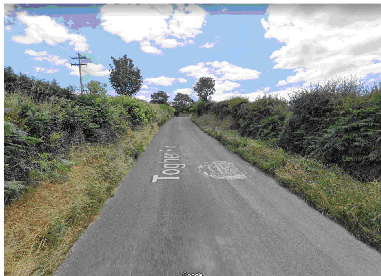
Sightlines - Image A - South