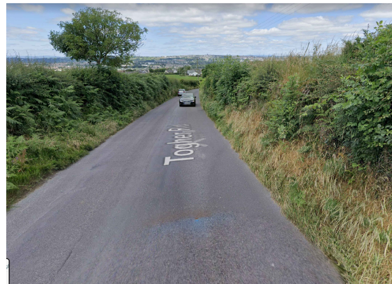
Sightlines - Image B - North