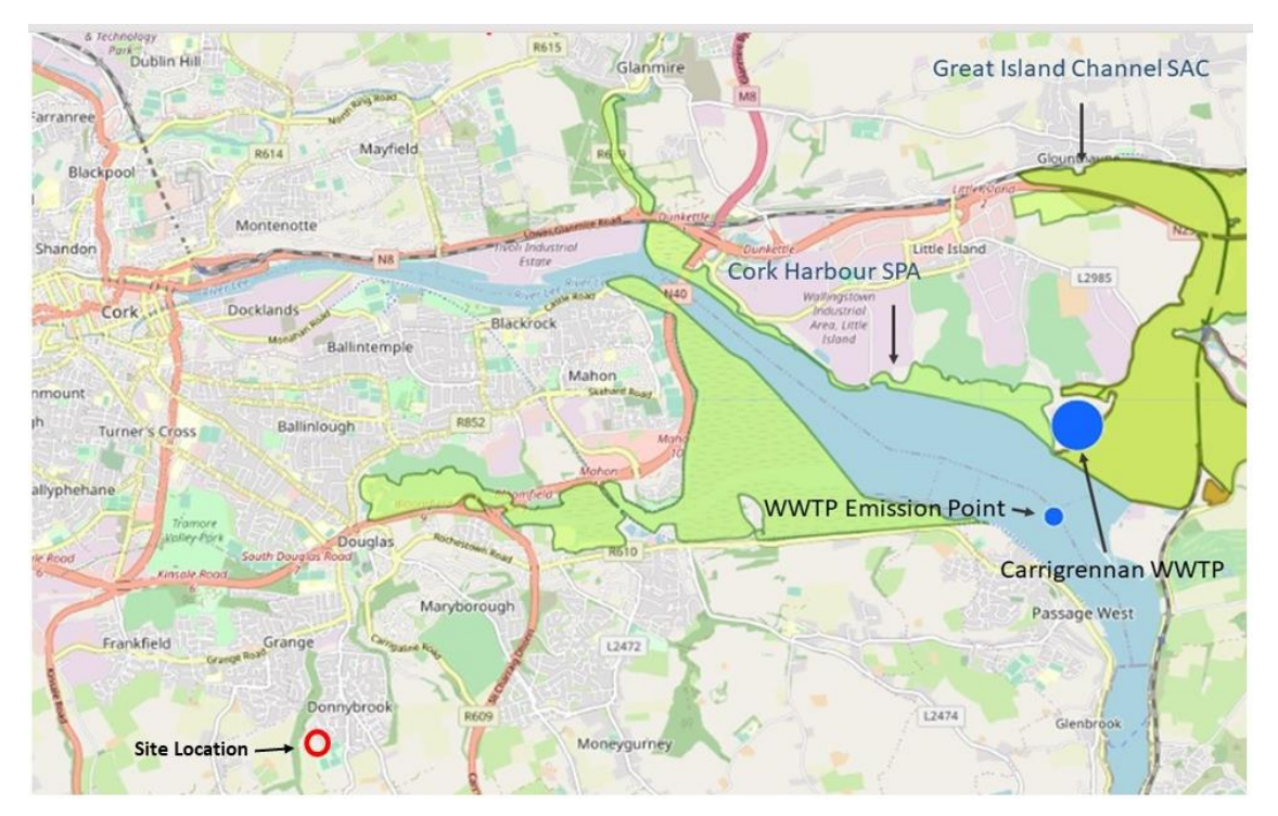
Figure 4 location of proposed development relative to Cork Harbour SAC and Carrigrennan WWTP.