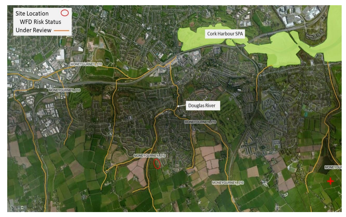
Figure 6 Site location and WFD status of watercourses in proximity.

The water quality of Lough Mahon, a transitional water body which forms part of Cork Harbour SPA, was determined from the EPA Interactive Mapviewer<sup>3</sup>. The Water Quality status for 2018 – 2020 was determined to be "eutrophic", while the Water Framework Directive (WFD) status for the period 2013 - 2018 is identified as "Moderate", and "At Risk" of not achieving good status.