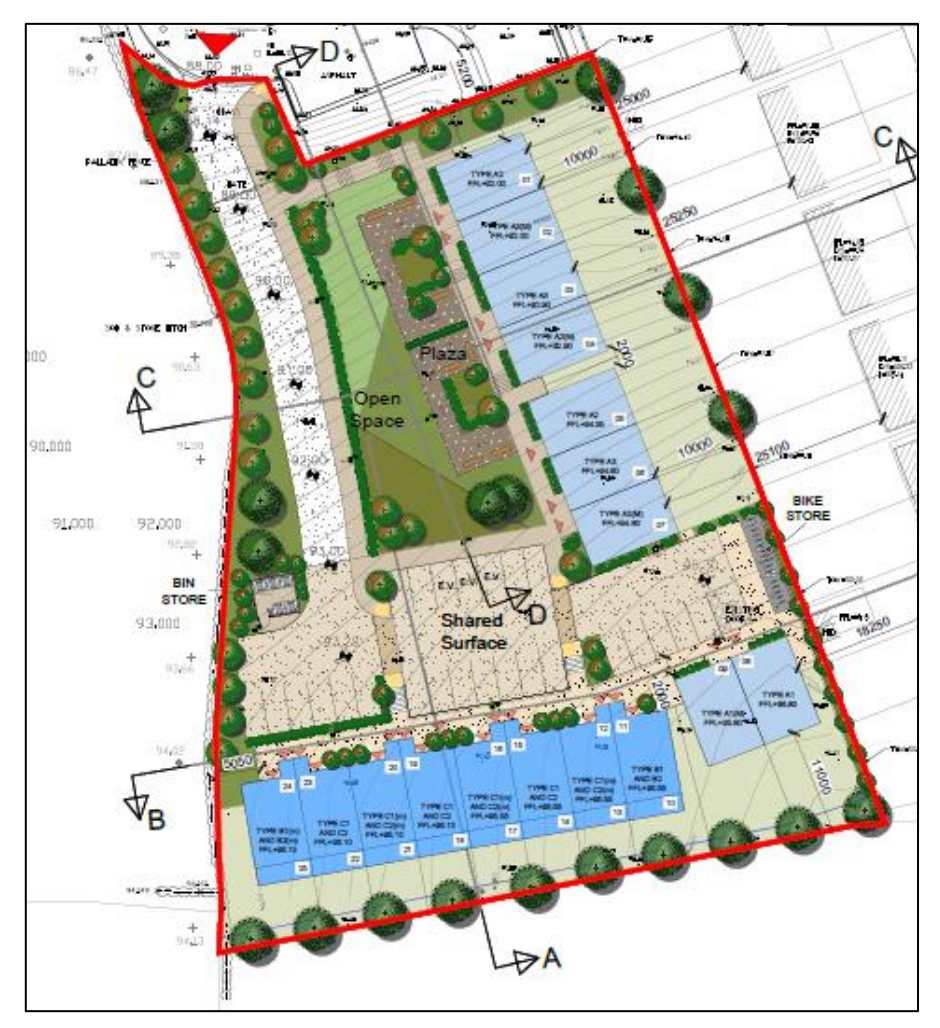
Figure 2 Site Plan prepared by Deady Gahan Architects.