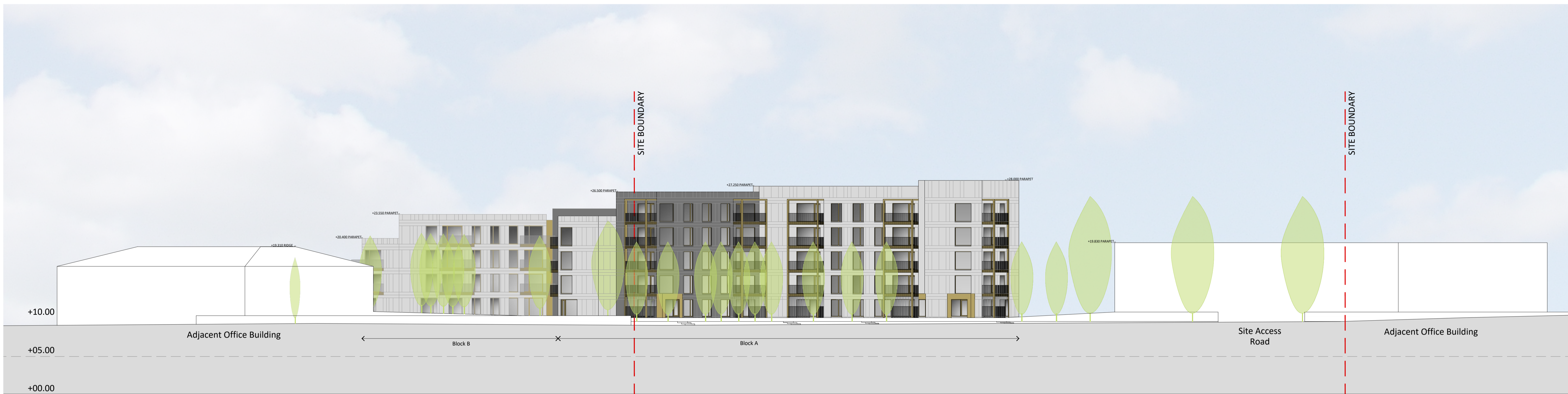
Site Elevation CC