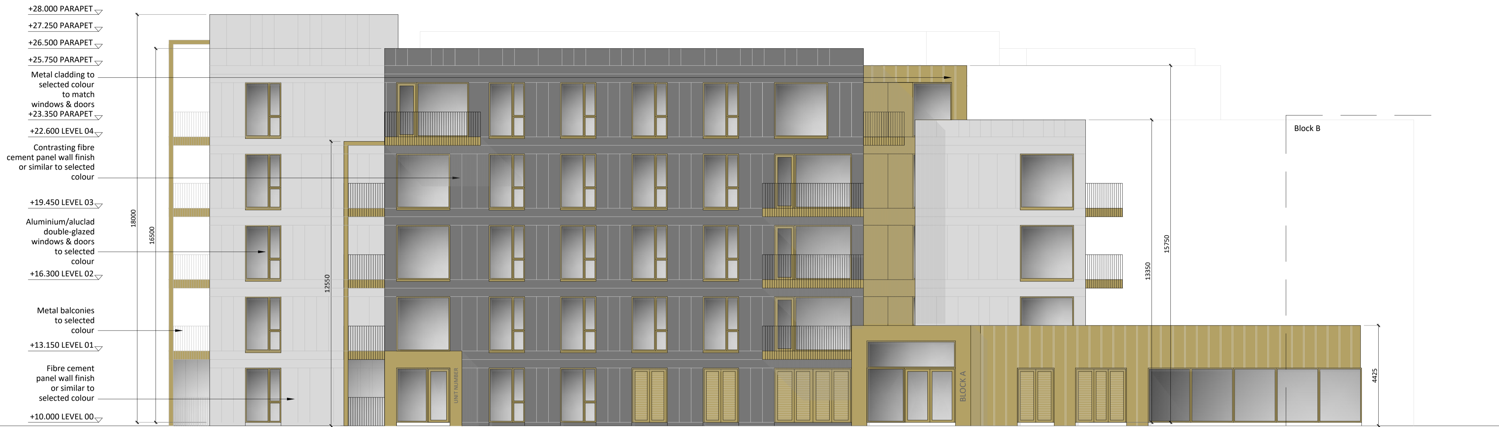
Block A - North Elevation