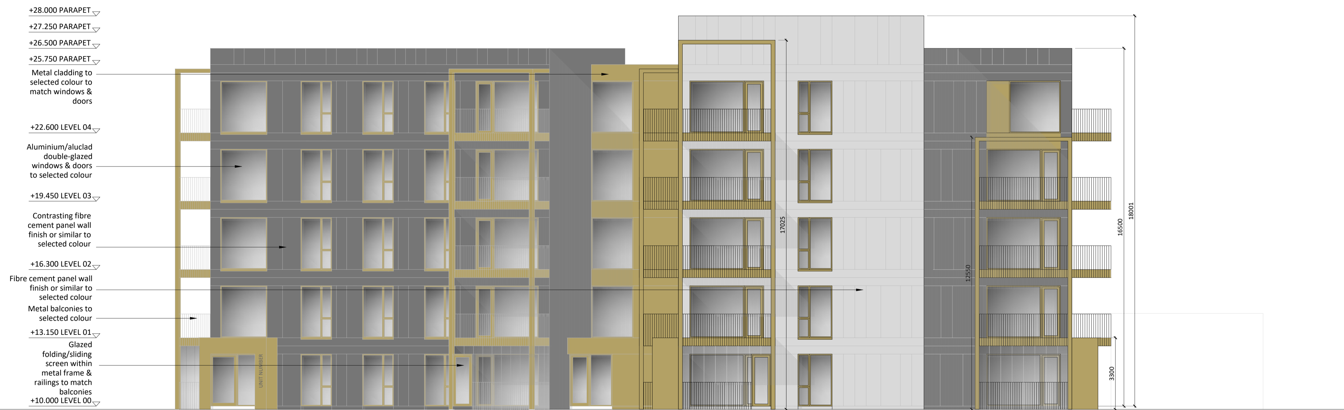
Block A - East Elevation to Bessboro Road