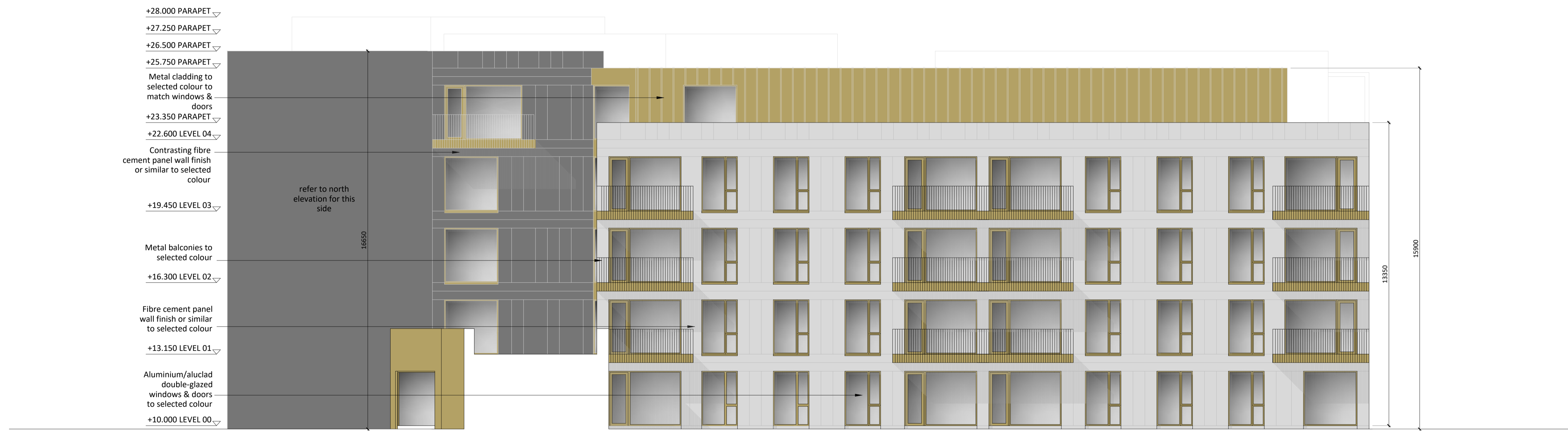
Block A - West Elevation