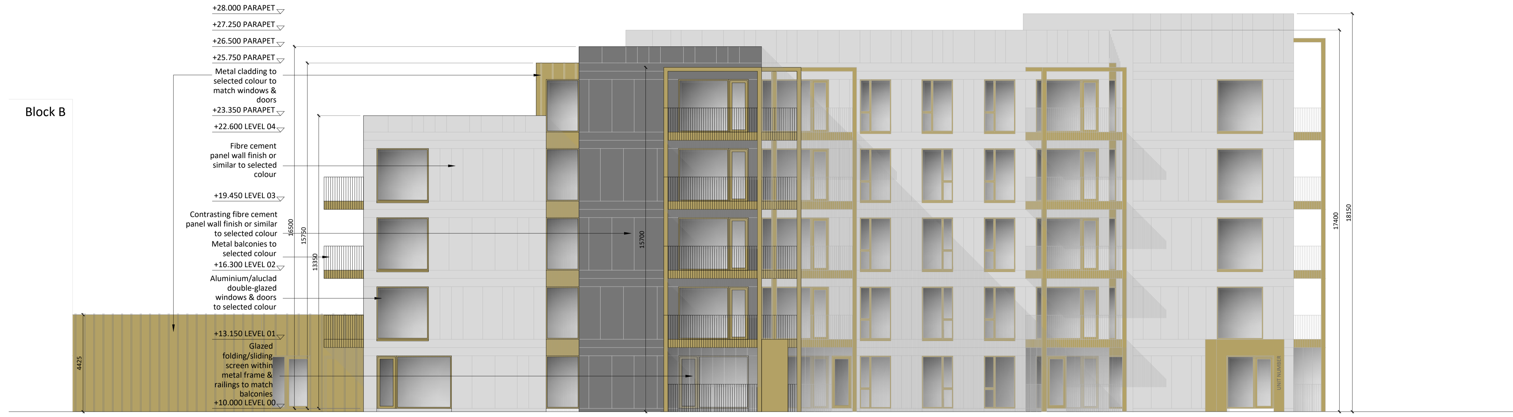
Block A - South Elevation