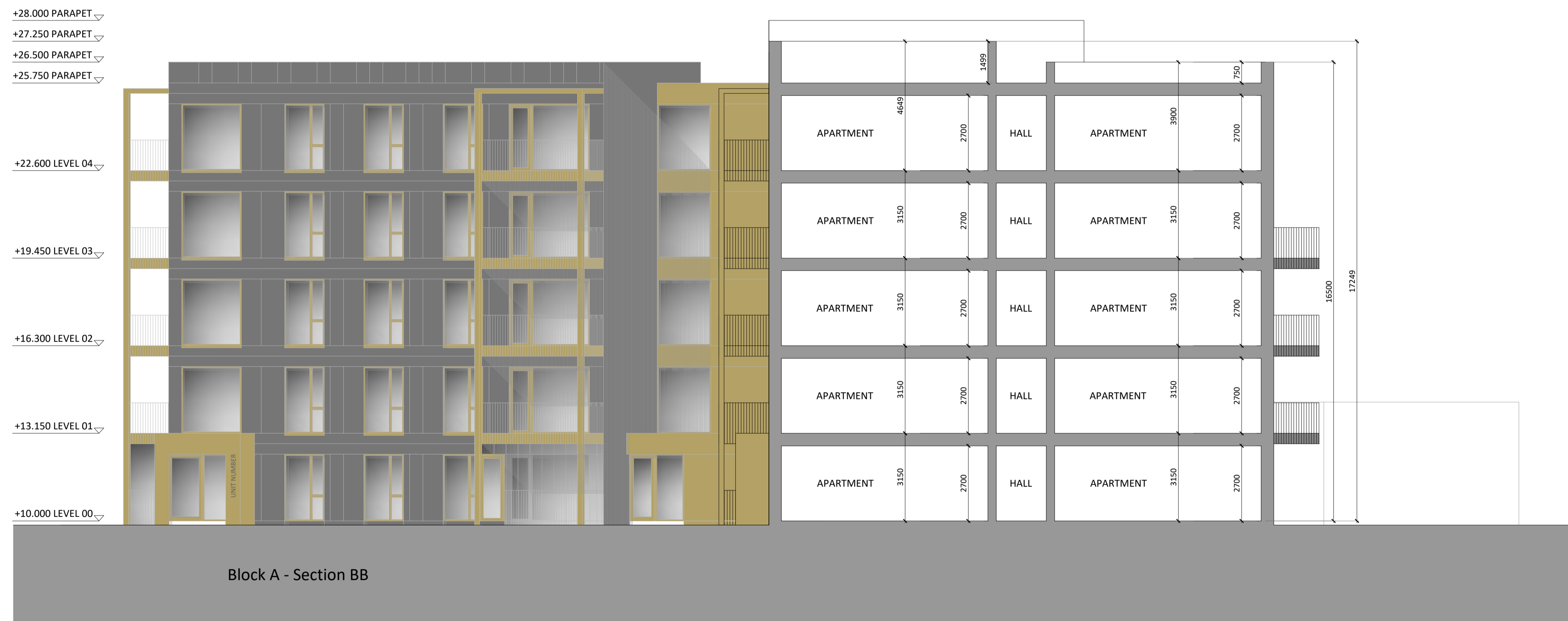
Block A - Section AA & Section BB