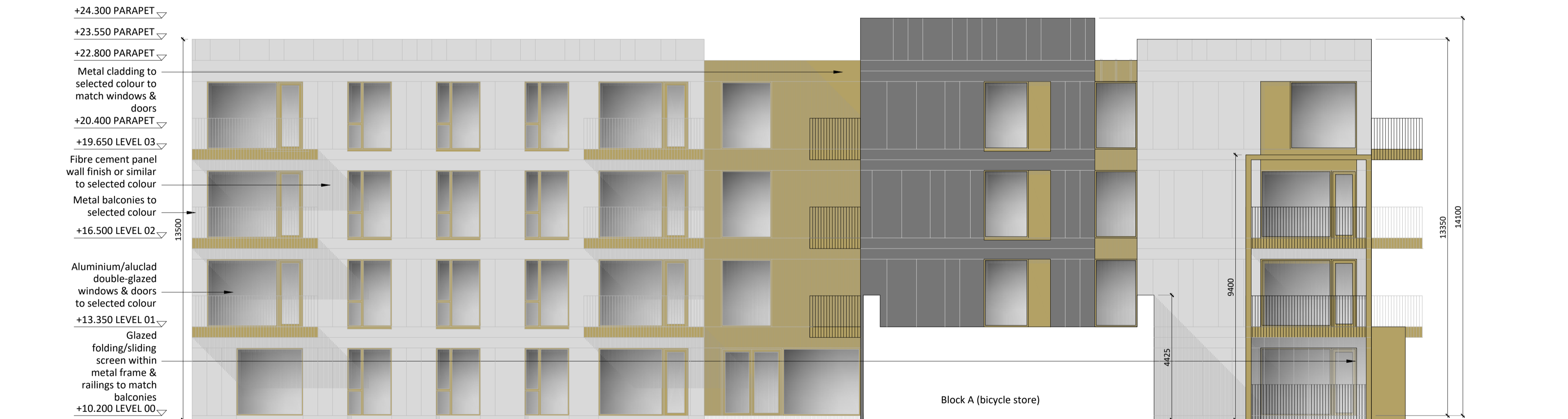
Block B - East Elevation