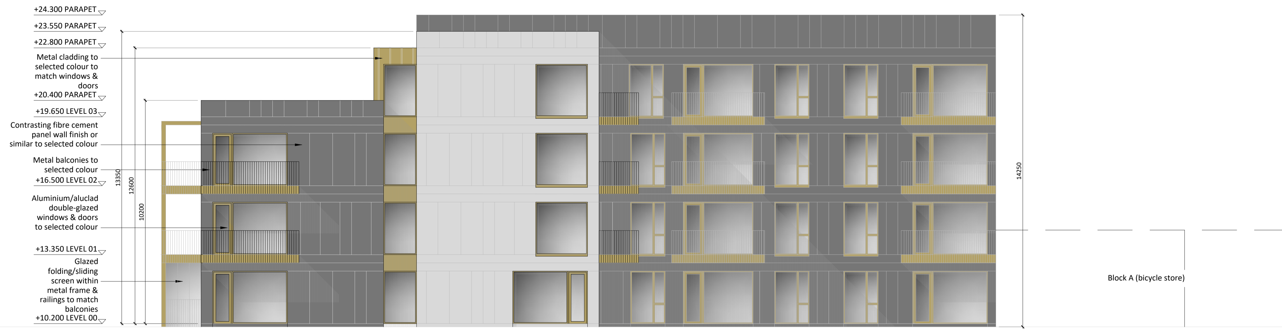
Block B - South Elevation