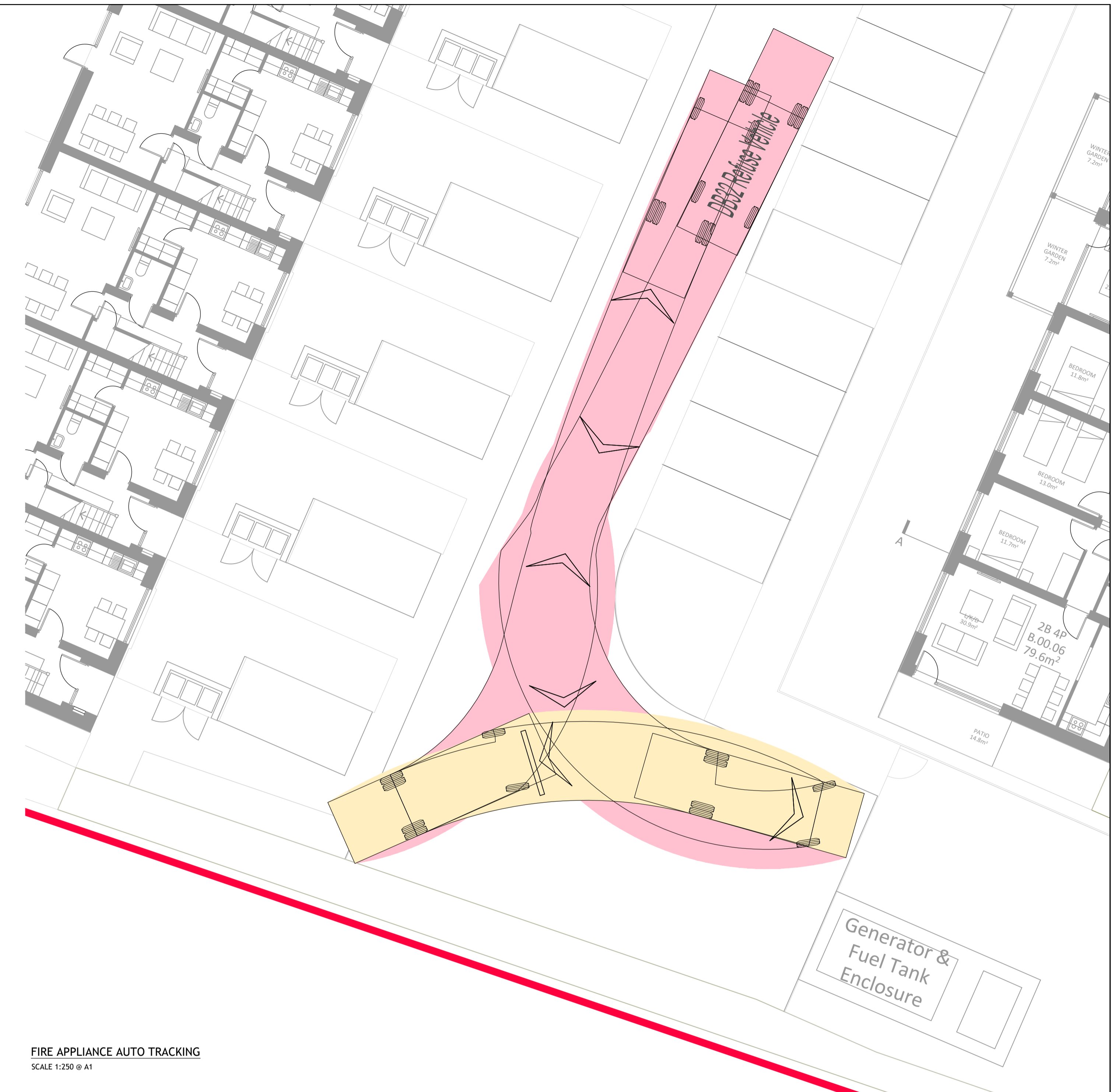
FIRE APPLIANCE AUTO TRACKING SCALE 1:250 @ A1