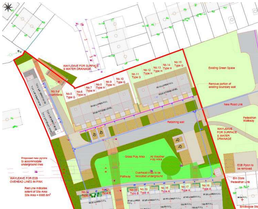
Fig 7.1: Watermains detail (refer to drawing NBHD-WM-P01)

The construction of the water supply pipe network shall be in accordance with Irish Water publication “Code of Practice for Water Infrastructure”.