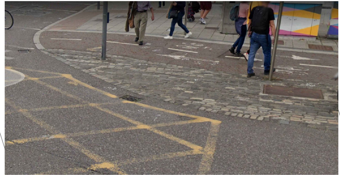
Image 01 - Cobble stone Paving installed on the corner of Sth / Parnell Place Proposed - Similar Cobble stone paving to be used in the Sth Mall median