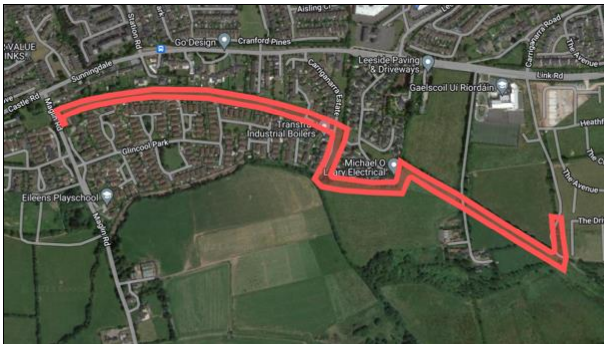
Figure 1: Route Area.

The route is predominately in an urban area. There is a short section that is located within a farmland setting. The route passes through two green areas associated with housing estates. These areas are amenity grassland with some associated tree planting. There are a number of treelines/hedgerows that have been recently removed at the eastern side of the development.