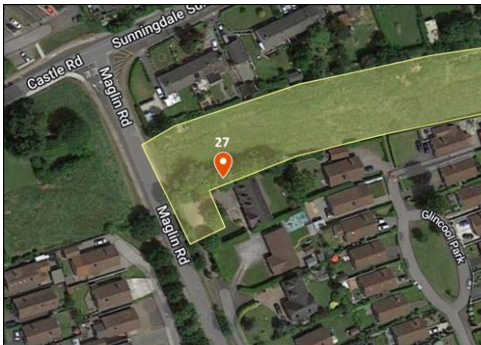
Figure 8: Results for western end at Maglin Rd.