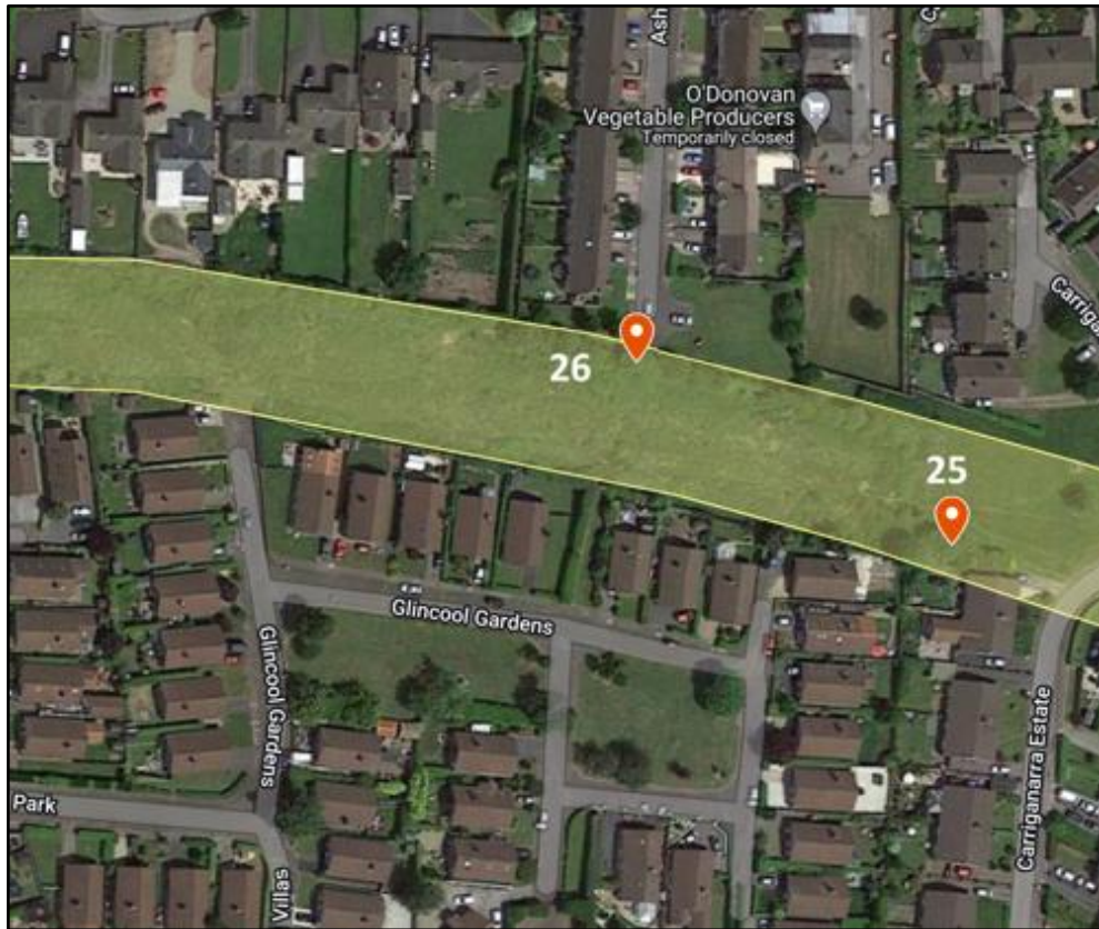
Figure 7: Results in Glincool.