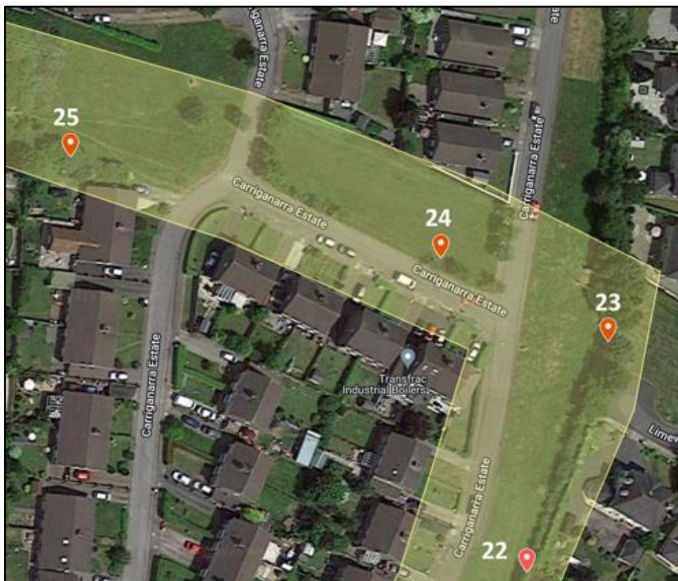
Figure 6: Results in Carriganarra Estate.