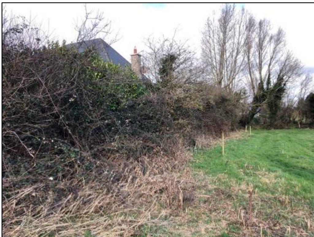
Photo 4: Sites 13 on the left, looking north at site 10, 11 and 12.