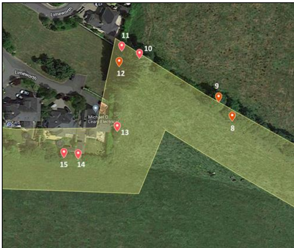
Figure 4: Results for fields east of Limeworth.