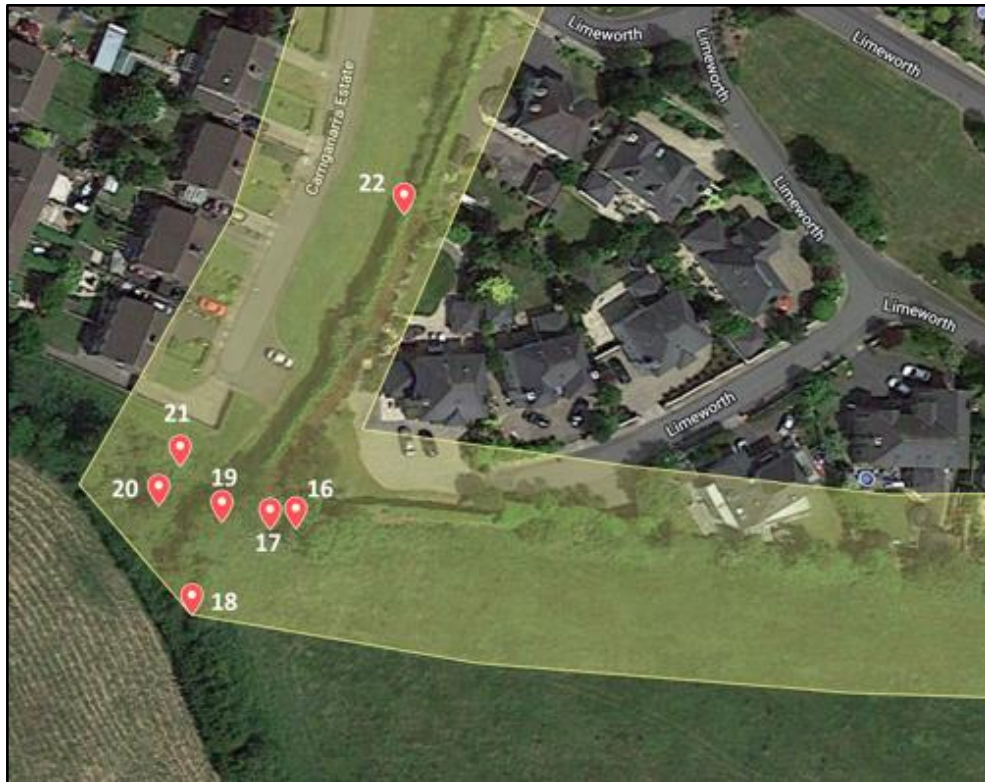
Figure 5: Results for fields south of Limeworth and Carriganarra Estate. Riparian section.