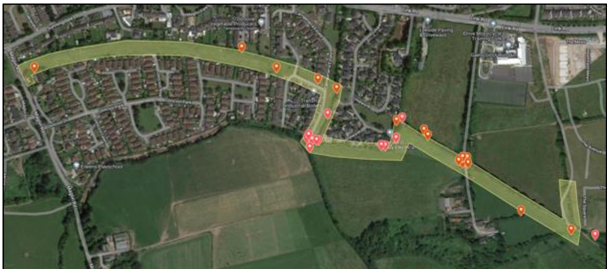
Figure 2: Overall findings map.

The impacts are detailed as to the likelihood of what the proposed route will require in terms of the construction footprint. All the trees/hedgerows detailed are those within that footprint.