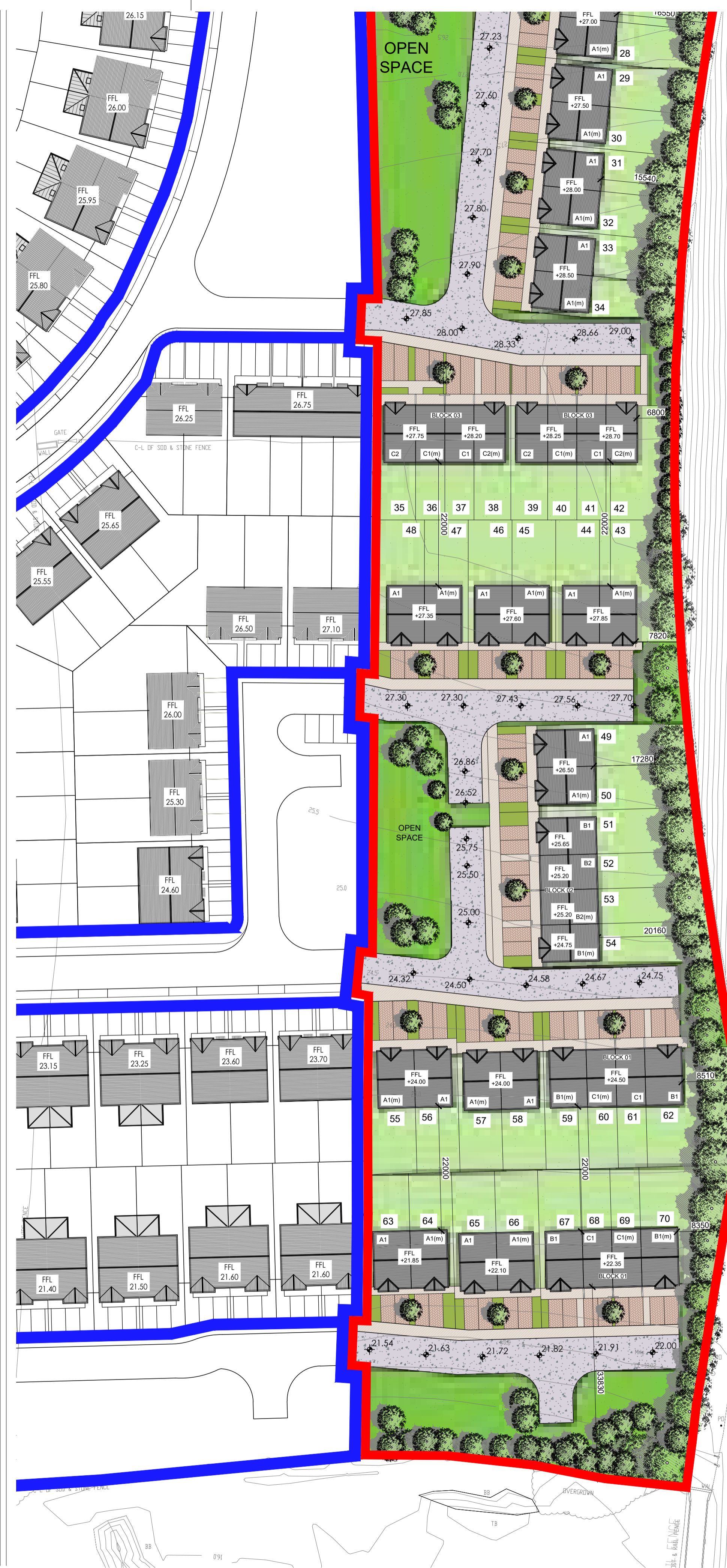
SITE PLAN - PART B SCALE 1:500 @A1

DO NOT SCALE. WORK TO FIGURED DIMENSIONS ONLY. ALL EXISTING DIMENSIONS TO BE CHECKED ON SITE. DRAWN ON AUTOCAD R2004 AT DEADY GAHAN ARCHITECTS LTD LAYERS ON THIS DRAWING COMPLY WITH BS 1192: PART 5