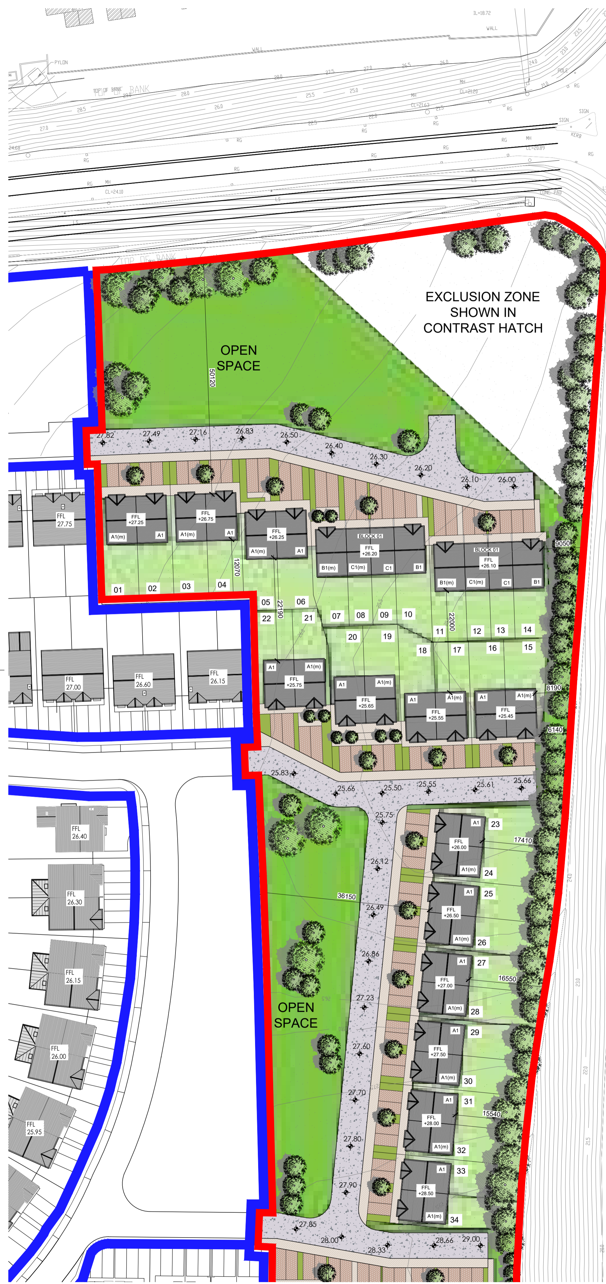
SITE PLAN - PART A SCALE 1:500 @A1