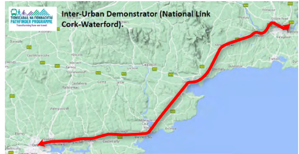
Pathfinder Cork-Waterford Route

These proposals align with Cork City Council's broader regeneration plans for the North Docks and Tivoli areas. Over the course of the next decade there will be significant private sector and public sector investment in the Cork Docklands which will transform the area into a world class destination including high quality quayside amenity spaces.