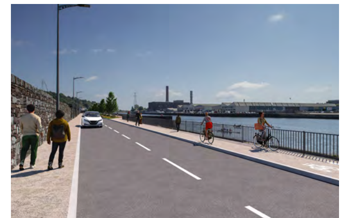
Photomontage of proposed layout on Horgan's Quay