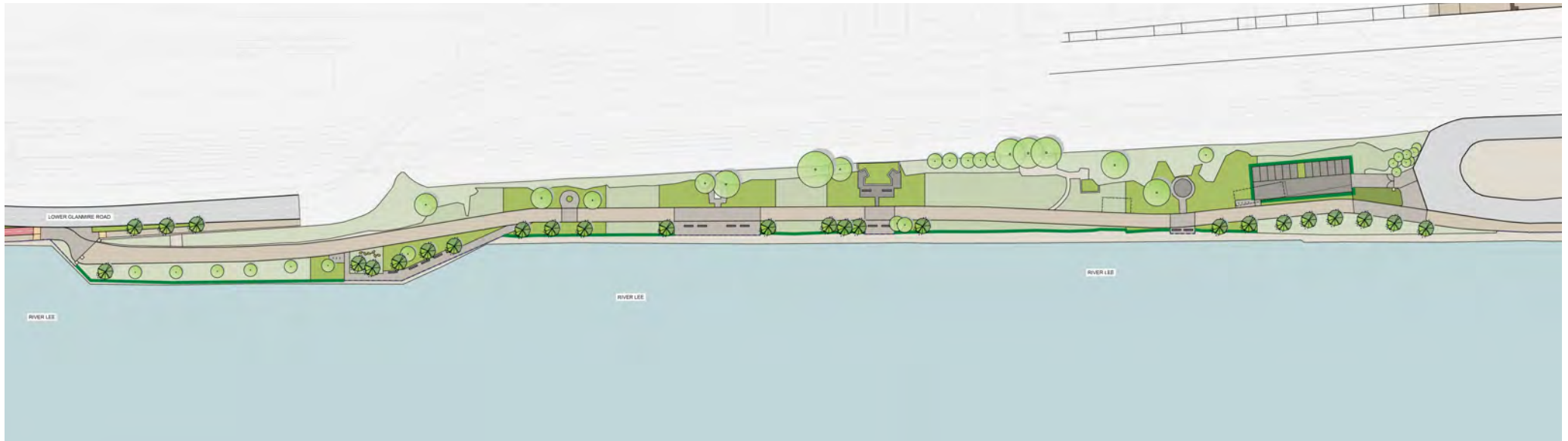
Port of Cork Gardens - Layout and Landscape Plan

Comhairle Cathrach Chorcaí Cork City Council