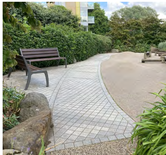
Illustrative example of play area