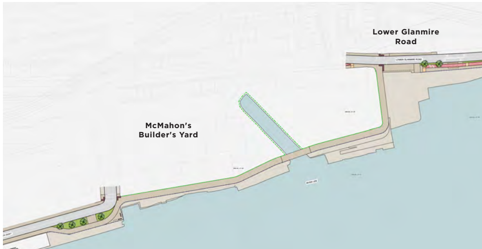
McMahon Site - Layout and Landscape Plan

Comhairle Cathrach Chorcaí Cork City Council