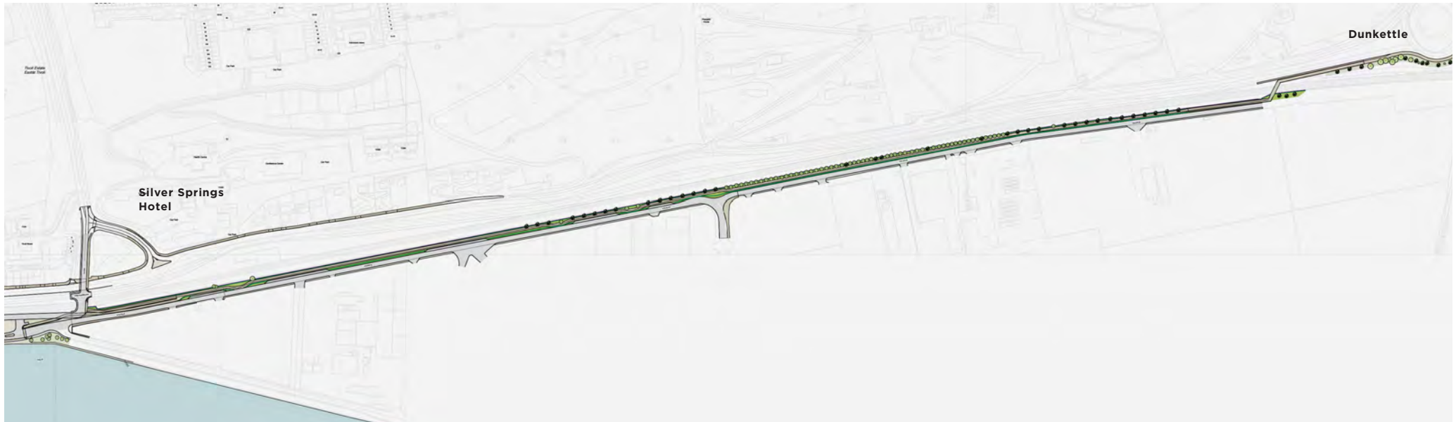
Tivoli Estate Road - Layout and Landscape Plan

Comhairle Cathrach Chorcaí Cork City Council