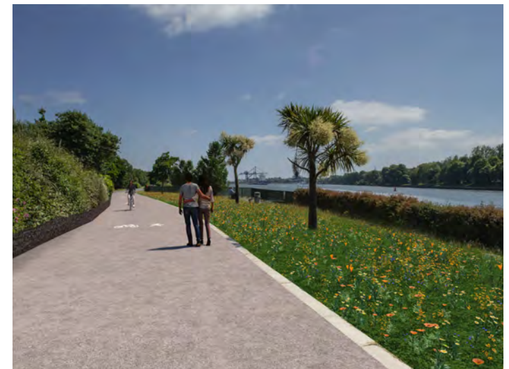
Photomontage of proposed layout Port of Cork (2000) Gardens