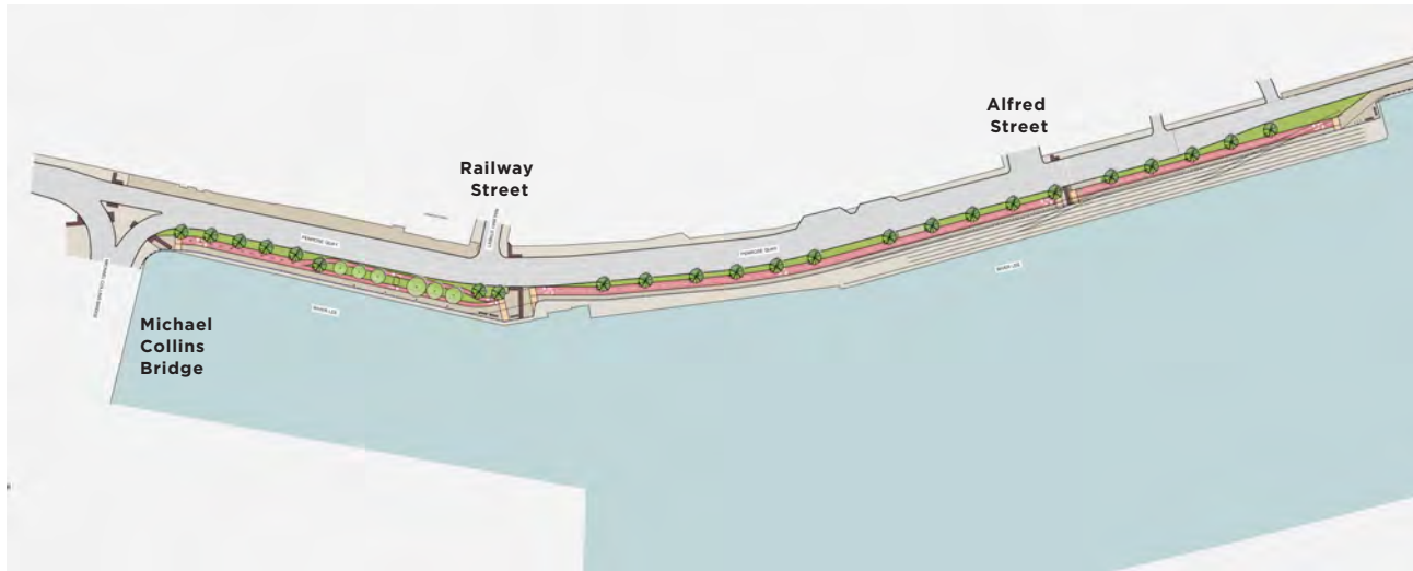
Penrose Quay - Layout and Landscape Plan

Comhairle Cathrach Chorcaí Cork City Council