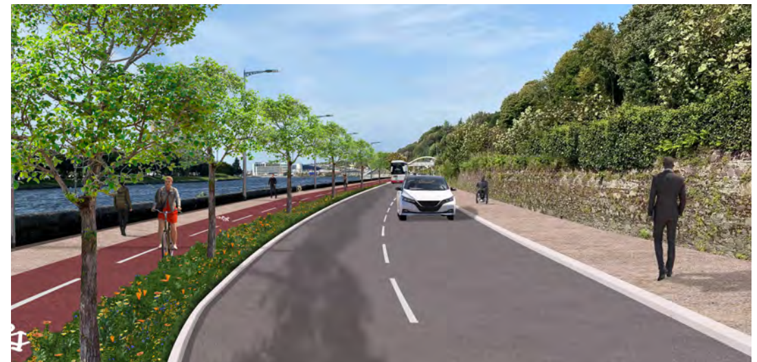
Photomontage of proposed layout on Lower Glanmire Road