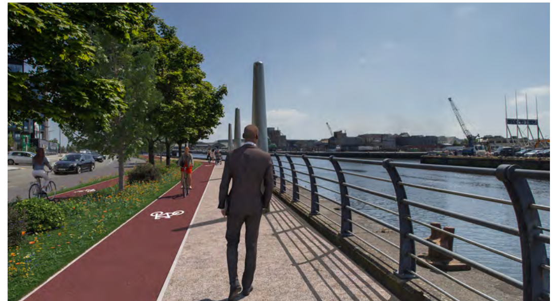
Photomontage of proposed layout Penrose Quay