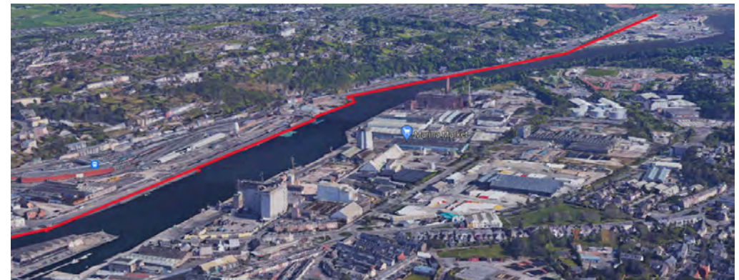
5km route from City Centre to Dunkettle

The Glanmire to City Cycle Route (Phase 2) establishes an active travel route through the North Docks and Tivoli which will be enhanced over time with significant investment in the public realm as the area develops.