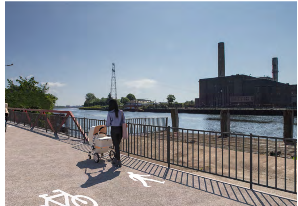
Photomontage of proposed layout in McMahon site