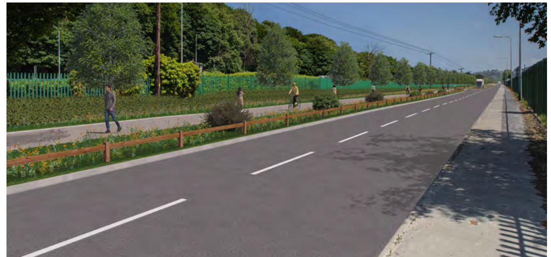
Photomontage of proposed layout Tivoli Estate Road