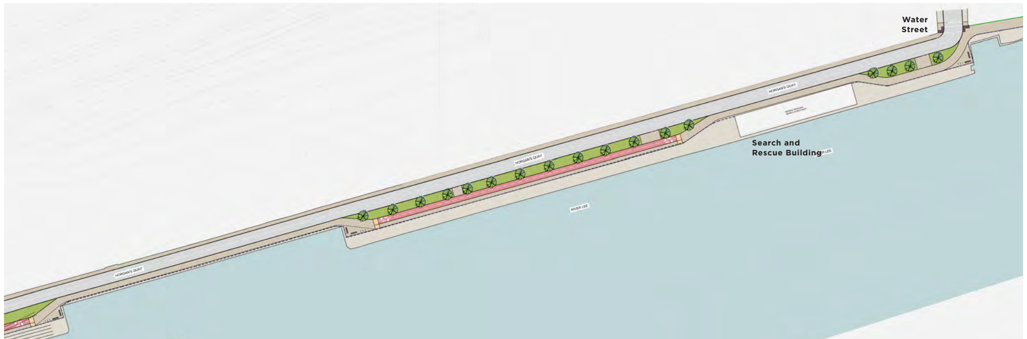
Horgan's Quay - Layout and Landscape Plan

Comhairle Cathrach Chorcaí Cork City Council