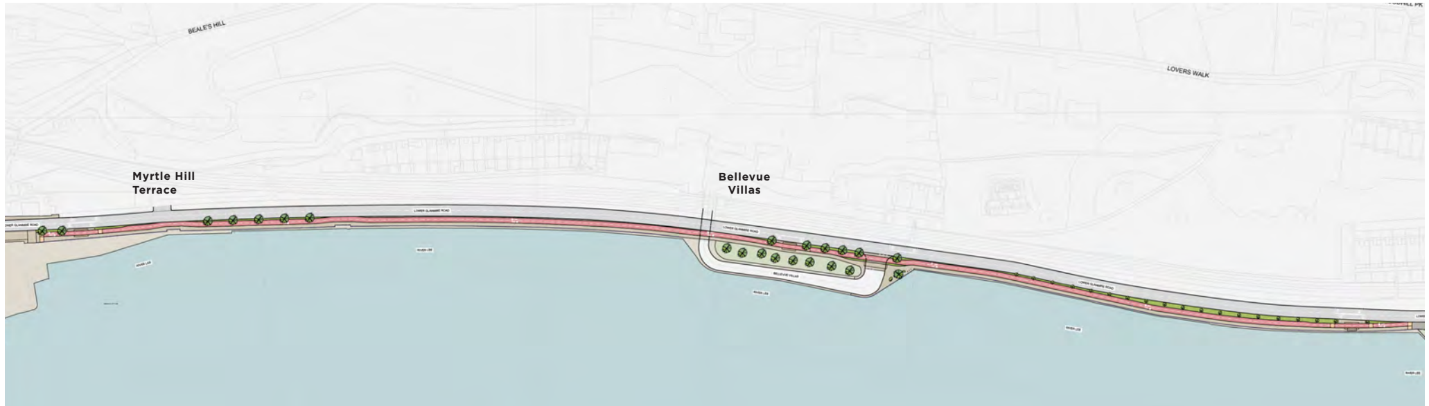
Lower Glanmire Road - Layout and Landscape Plan

Comhairle Cathrach Chorcaí Cork City Council