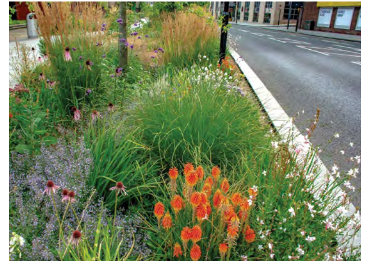
Illustrative Example of pollinator friendly planting